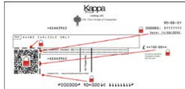
THE UCN PLUS® securely encrypts 'key' cheque details

Contact one of our sales teams for more information or email enquiries@tallgroup.co.uk